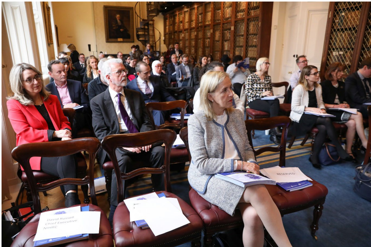
Pictured are participants at the seminar ‘Rights at risk of divergence on the island of Ireland: 25 years on from the Belfast (Good Friday) Agreement’.