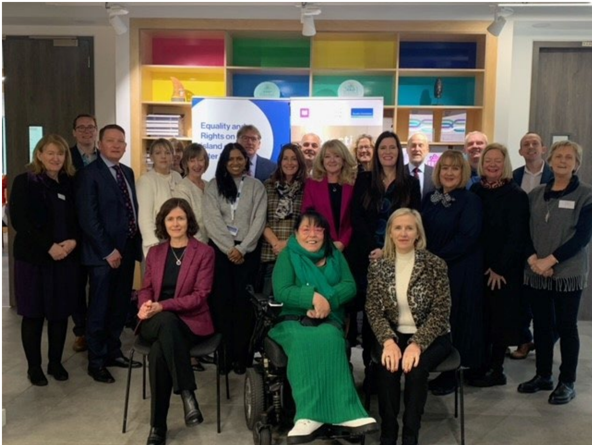
Pictured are Commission members and senior staff from across IHREC, ECNI and NIHRC at the second annual meeting of the three full Commissions, in IHREC's offices in Dublin, November 2022.