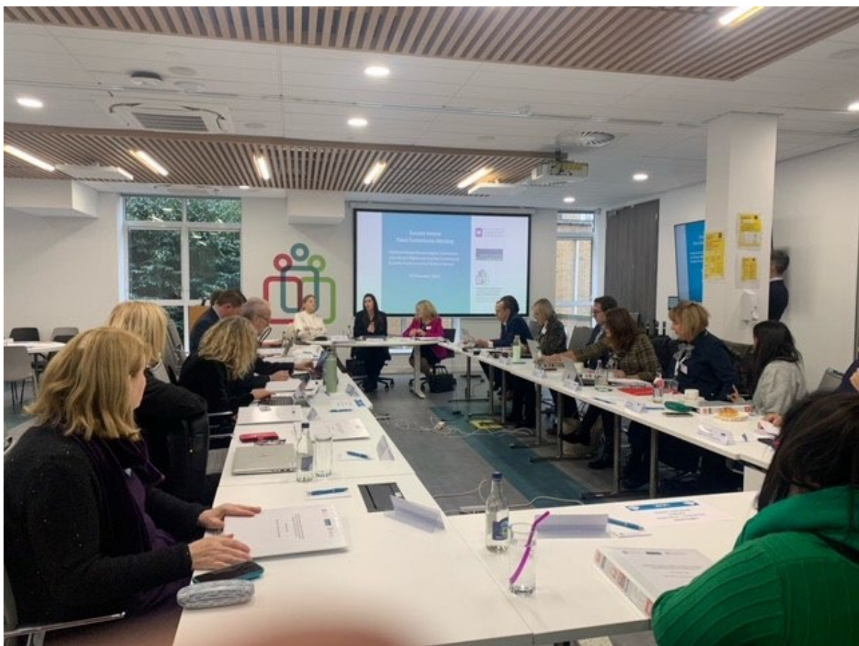
Pictured are members of the three Commissions meeting in IHREC's offices in Dublin.