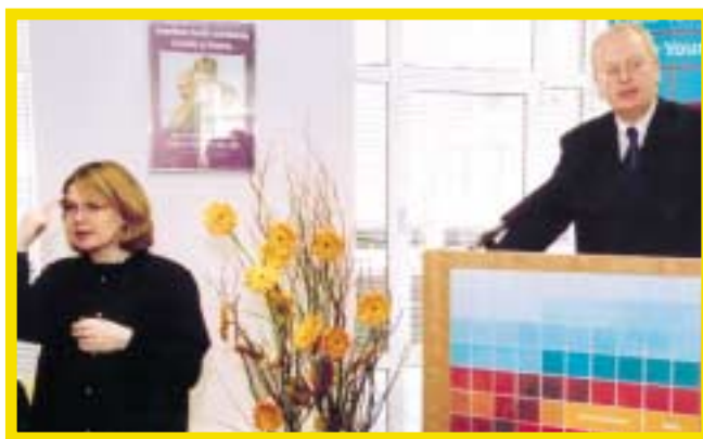
Michael Mc Dowell, T.D., speaking at the launch of the Annual Report 2002.