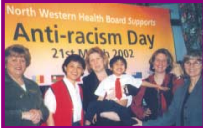
Staff from the NWHB and Our Lady's Hospital Manorbham celebrate Anti-Racism Day 2002.

Travellers and people with disabilities through targeted services such as the North West Supported Employment Programme;