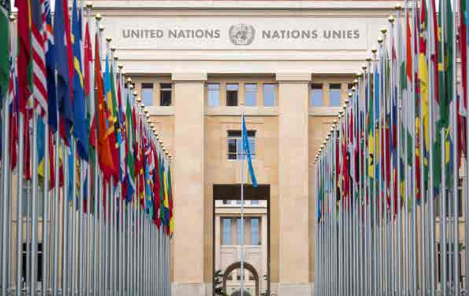
UN BUILDING, GENEVA.