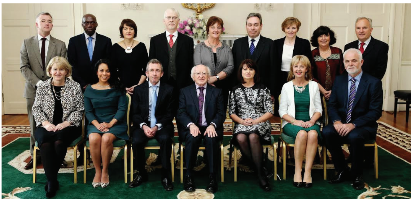
Below: Chief Commissioner and Members of the Commission receiving their seals of office from President Michael D. Higgins at Áras an Uachtaráin.